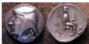
Arsaces II Mule

AR Drachm, 4.09 g Mint/ Hecatompylos? , undated Obv/ beardless head left, wearing bashlyk; circular border of dots; border of dots Rev/ beardless archer, wearing kyrbasia and cloak, seated right on backless throne; in hand, bow; below bow A; behind archer, single-line inscription APΣAKOY; border of dots Photo/ by permission Classical Numismatic Group , CNG 36, lot 3 - Sellwood 5.1 - Shore 3 (this coin)