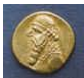
Mithradates II Modern Forgery

Click on the coin image at left to see three examples of gold forgeries of Sellwood type 27.1 silver drachms ( Forgeries 2 , 3 and 6 )