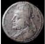
Darius of Media Atropatene