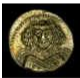
Darius of Media Atropatene