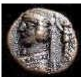
Darius of Media Atropatene