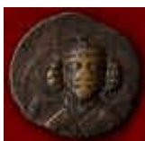
Darius of Media Atropatene