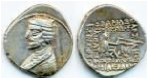
Darius of Media Atropatene

- Sellwood 36.6 variant (no T behind archer)