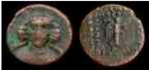
Darius of Media Atropatene

AE 17 mm, 2.52 gm, die axis = 1h Mint/ Ecbatana or Rhagae ?, undated Obv/ bust facing with short beard wearing necklet with medallion Rev/ horse right; Greek legend obscured Photo/ by permission Thomas K. Mallon, The Coins and History of Asia - Sellwood 35.15 or 35.16?