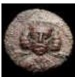
Darius of Media Atropatene

AE 14 mm, 1.91 gm, die axis = 1h Mint/ Rhagae , undated Obv/ bust facing with short beard wearing necklet with medallion Rev/ Nike walking right with wreath in raised hand; Greek legend Sellwood iii: [ΒΑΣ]ΙΛΕ[ΩΣ] ΜΕΓΑΛ[ΟΥ] / [ΑΡΣΑΚΟΥ] / [ΘΕΟΠΑΤΩΡΟΣ ΕΥΕΡΓΕΤΟΥ] / [ΕΠΙΦ]ΑΝΟΥΣ [ΚΑΙ ΦΙΛ]ΕΛΛΗΝΗΟ[Σ] (left lines read from outside) Photo/ by permission Thomas K. Mallon, The Coins and History of Asia - Sellwood 35.17 - Shore 504 (as Phraates III)