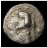
Darius of Media Atropatene

There is an interesting anomaly on the Type 36 coins of Darius. A small number of coins clearly bear an earring and a separate web page presents the known examples of these coins. Click here to view the "earring coins of Darius".