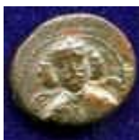
Darius of Media Atropatene