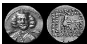
Darius of Media Atropatene