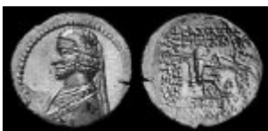
Darius of Media Atropatene