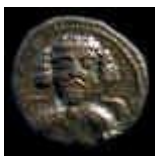
Darius of Media Atropatene