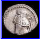
Vologases III (A.D. 105-147)