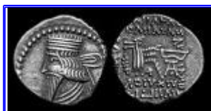
Vologases III (A.D. 105-147)