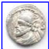
Vologases III (A.D. 105-147)