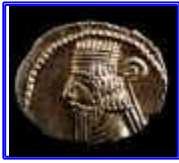
Vologases III (A.D. 105-147)