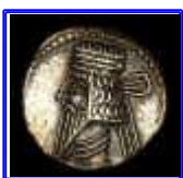
Vologases III (A.D. 105-147)