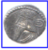
Vologases III (A.D. 105-147)