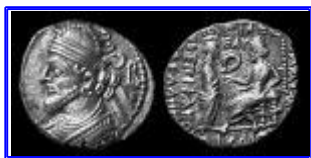
Vologases III (A.D. 105-147)