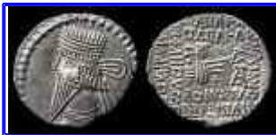
Vologases III (A.D. 105-147)