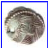
Vologases III (A.D. 105-147)