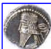
Vologases III (A.D. 105-147) Modern Forgery

Click the image at left to see the forgery of a Sellwood type 78 coin