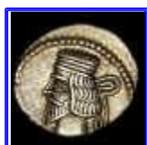
Vologases III (A.D. 105-147)