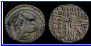
Vologases III (A.D. 105-147)

- Sellwood 78.8 variant (without the "+" above bow)