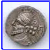
Vologases III (A.D. 105-147)

See the page describing Vologases III and IV Bronzes with "Tyche Reverse"