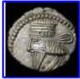
Vologases III (A.D. 105-147)