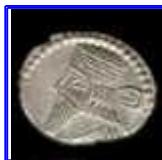
Vologases III (A.D. 105-147)