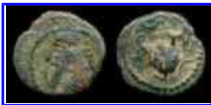
Vologases III (A.D. 105-147)

AE Chalkous, 1.24 g, 13 mm, die axis = 12h