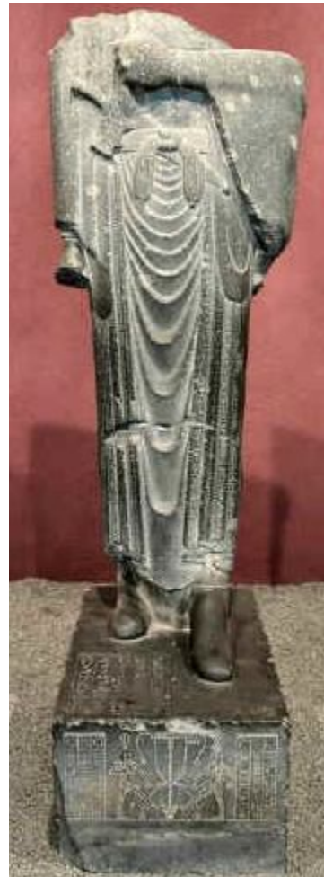
Picture Courtesy of Marco Prins and Jona Lendering - Livius.com (Click to enlarge)

Darius ruled about 50 million people in the largest empire the world had seen (Meyer, p. 85). His subjects ( kāra ) or their lands ( dahyu ) were several times listed, and also depicted, in varying order at Bīsotūn and Persepolis (Junge, 1944, pp. 132-59; Kent, 1943; Ehtecham, pp. 131-63; Walser; Hinz, 1969, pp. 95-113; Calmeyer), but the definitive account is carved on his tomb ( Elr. V, p. 722 fig. 46). In the relief on his tomb Darius and his royal fire are depicted upon the imperial "throne" supported by thirty figures of equal status, who symbolize the nations of the empire, as explained in the accompanying inscription (DNa 38-42). The text reflects Darius' status, ideals, and achievements. He introduces himself as "Great King, King of Kings, King of countries containing all