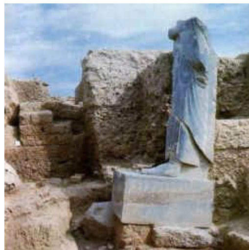
Statue of Darius the Great in Egyptian Style (Click to enlarge)