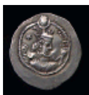
Kavad I (First reign 488 - 497 AD)

Gobl I/1 issue: 1st crown (crescent type) no date/vertical diadem ends; single reverse border