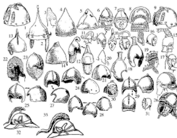
Figures 1–33. Pre-Islamic helmets, 14th–2nd centuries B.C.E.

1. Elam, 14th cent. B.C.E. 2. Luristan. 3. Marlik. 4-8. Hasanlu. 9. Safidrud. 10. Kūtorvin. 11-12. Luristan. (Nos. 2-12 dated to the first third of the first millennium B.C.E.) 13. Achaemenid helmet, from Egypt. 14. Achaemenid helmet, from Olympia. 15. Oxus Treasure (British Museum). 16-17. Helmets represented on seals. 18. Achaemenid helmet, from Azerbaijan. 19. Achaemenid helmet depicted on a 5th-cent. B.C.E. Greek vase. 20. Achaemenid helmet represented on a rock relief, Lycia. 21. Achaemenid helmet (Glasgow Museum).