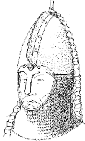
Sasanian Helmet, which later become prototype for European Helmets

Helmets came into use in the Middle East at a very early date. Among the oldest recovered specimens are Sumerian bronze helmets of the mid-3rd millennium B.C.E. from the royal cemetery of Ur. During the 9th-7th centuries B.C.E., bronze and iron helmets of different types became widespread in the Assyrian Empire. In the Caucasus region, local craftsmen influenced by Assyrian industry produced several types of Urartian helmets, mainly in bronze but some also in iron.